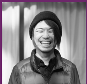
Hiyamizu