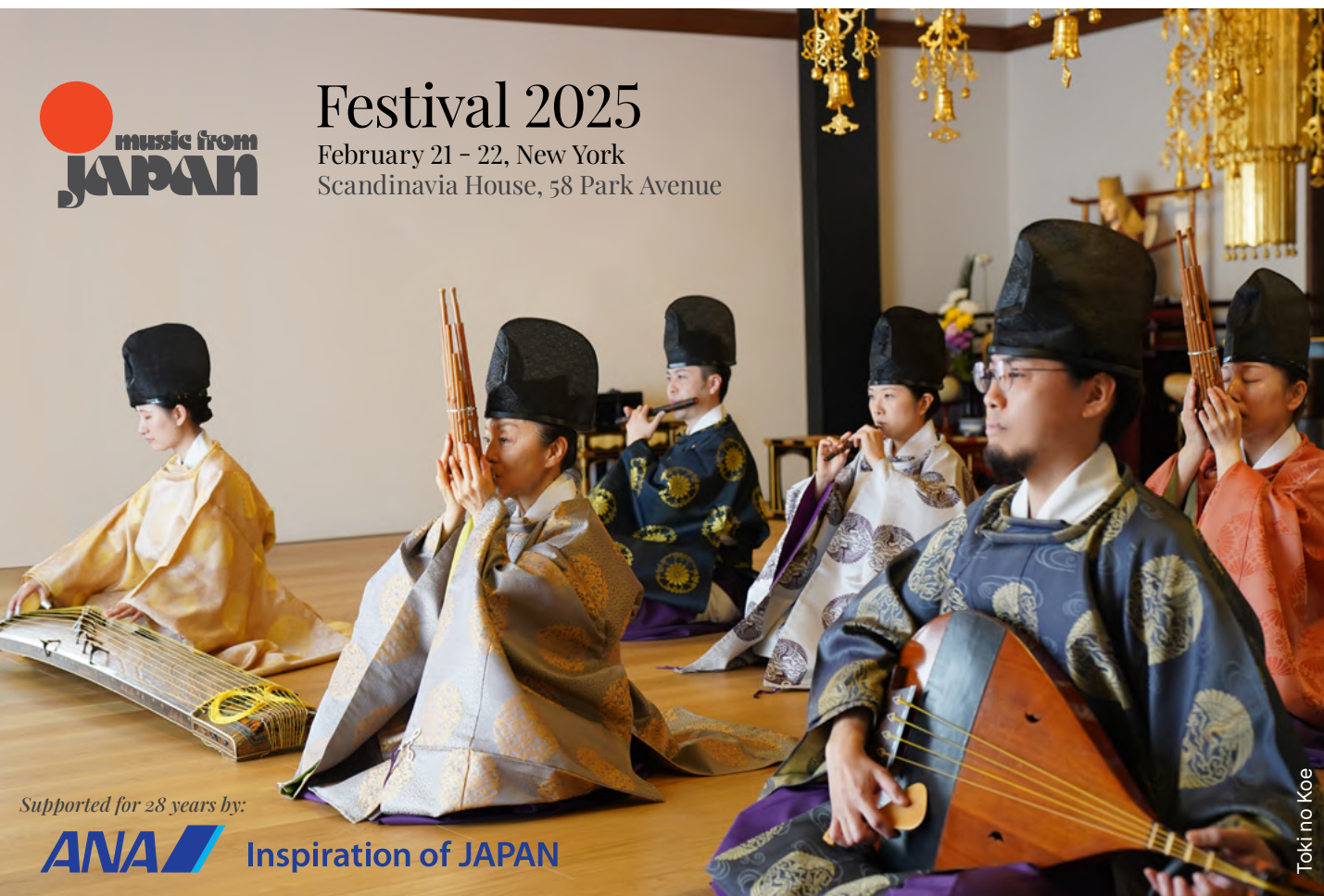
Toki no Koe